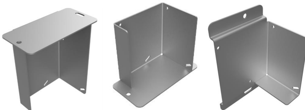
Figure 1: Possible mounting bracket configuration (wall, floor, and ceiling).