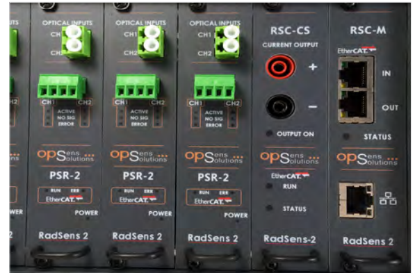
Two channels per module and two analog outputs

The new design ensures a true deterministic synchronization of the multi-channel measurements.