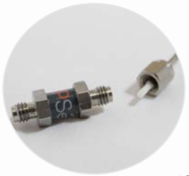
INNOVATIVE FIBER OPTIC QUICK CONNECT