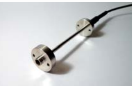
CONCRETE EMBEDDABLE EXTENSOMETER